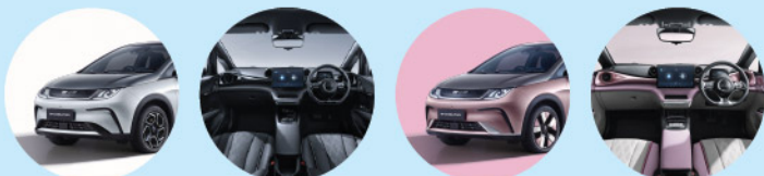
Ski White + Urban Grey