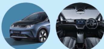
Atlantis Grey + Delan Grey